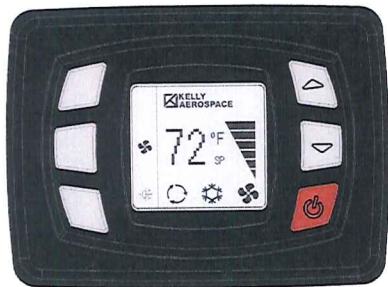
CB-2 Climate Controller