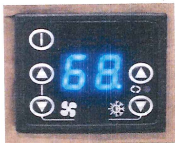
CB-1 Climate Controller