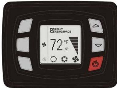
CB-2 Climate Controller

When the Air Conditioning system is in operation some load shedding is needed. The items that cannot be turned on (Section 2 Limitations) while the Air Conditioning is operating are not typically needed in flight conditions where the Air Conditioning system is needed.