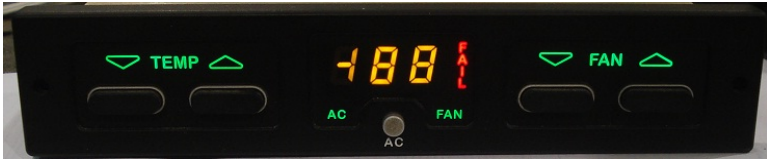
A1235 Climate Controller